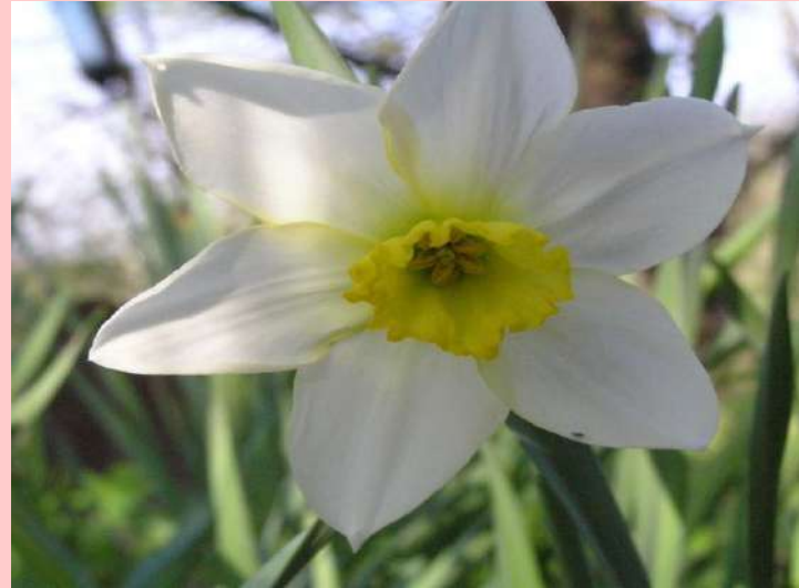
the symbol of Wales is the daffodil