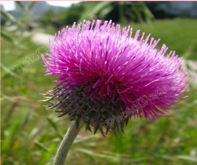
the symbol of Scotland is the thistle