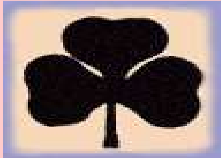
The symbol of Nothern Ireland is the shamrock