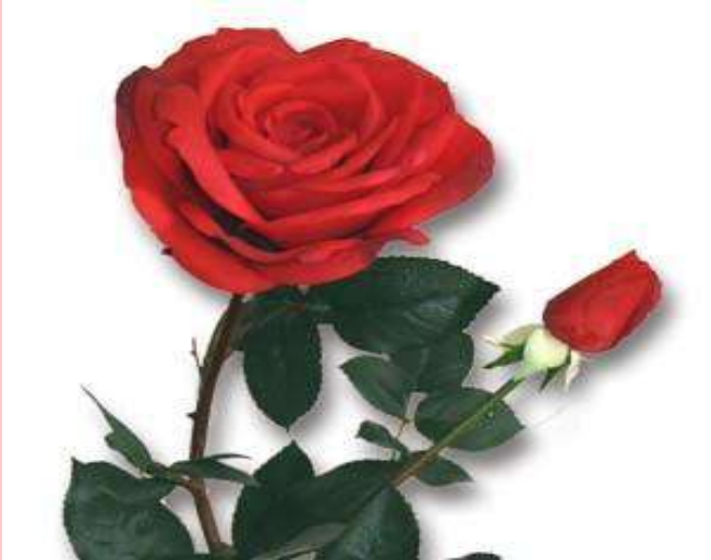
the symbol of England is the red rose